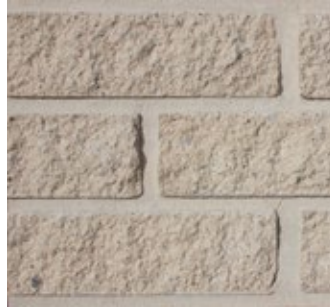
Light Buff F561-R