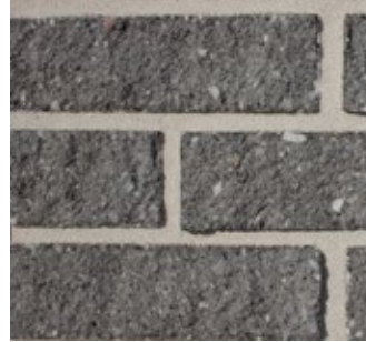
Slate Gray F521-R