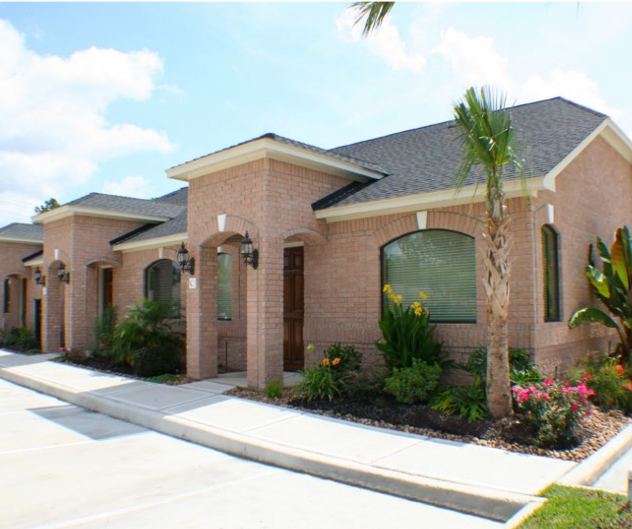
F531- R, Walnut Brown