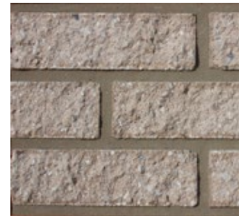
Sand Stone F571-R