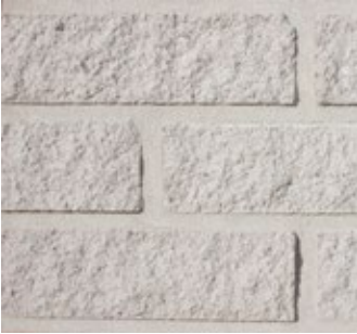
Arctic White F501-R