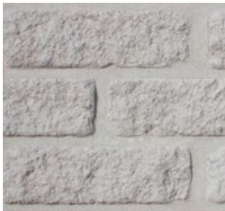
Arctic White Tumbled F501-RT