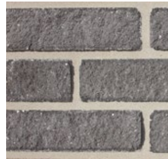
Steel Gray F591-DR