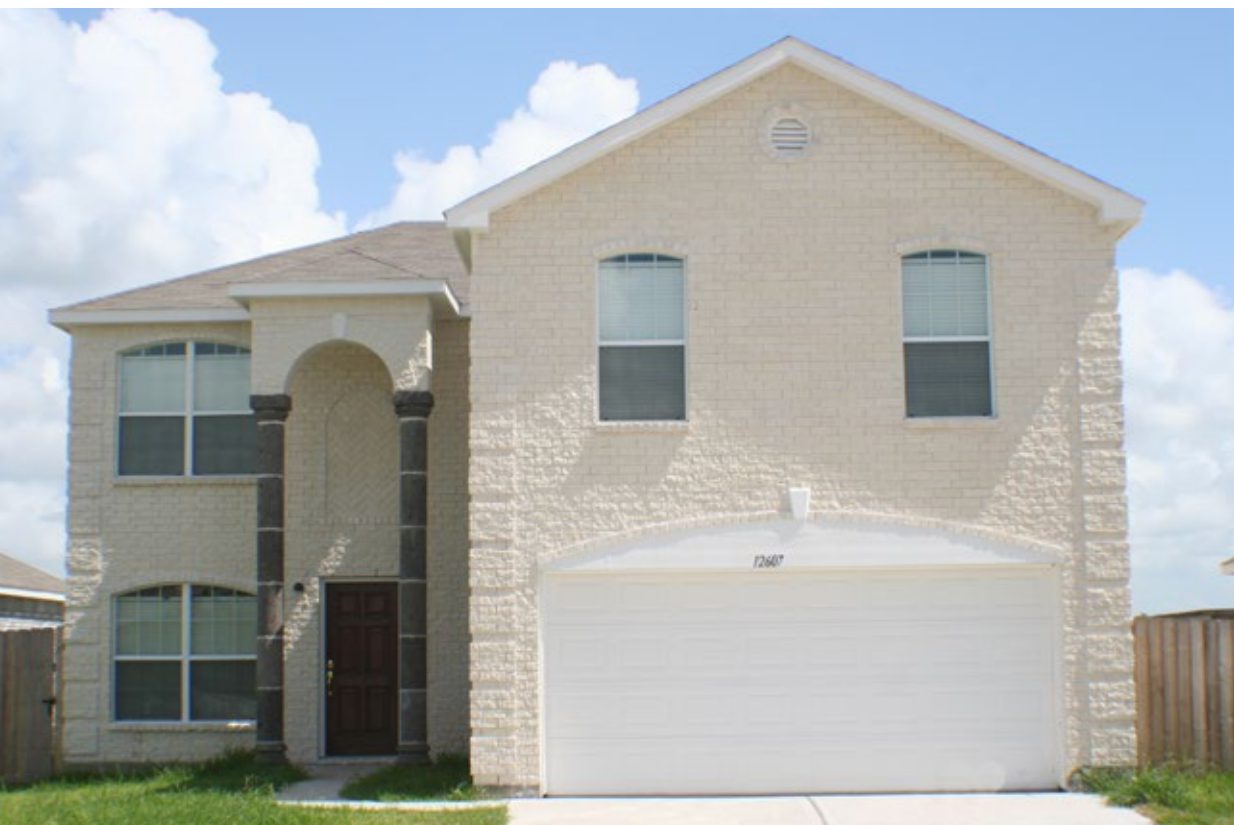
F561- R, Light Buff