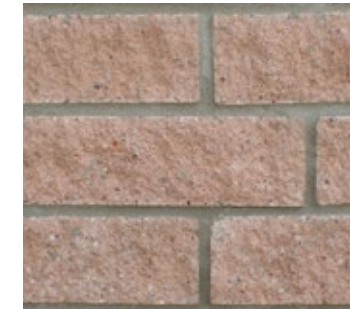
Walnut Brown F531-R